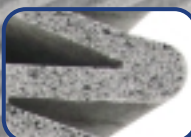
Rounded edges the flow optimized design results in better cleaning