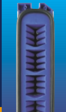
PE-head to stabilize and fix the complete filter element